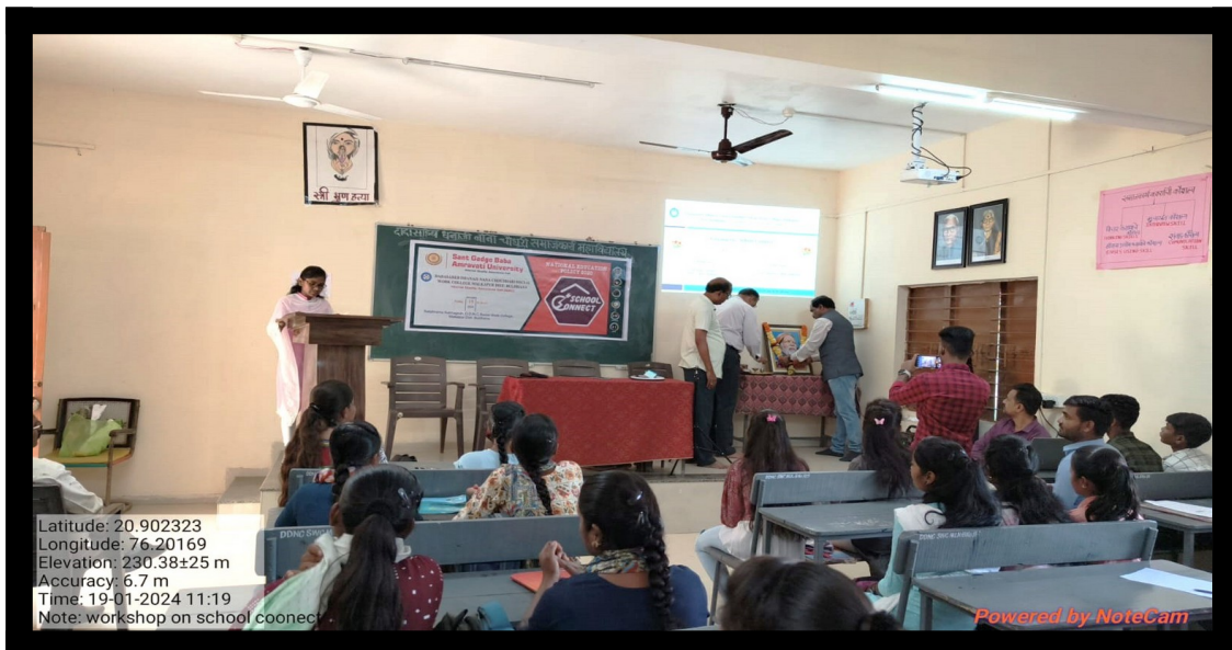
Dignitaries worshipping the Image of Sant Gadge Baba.